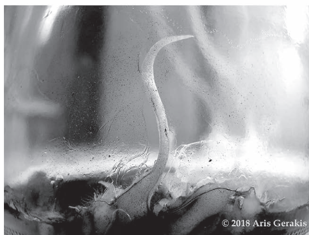
Fig. 1 Photographs of germinated seed: (a) Anacamptis laxiflora (Lam.), a few weeks after sowing and (b) Himantoglossum robertianum (Loisel.), a few months after sowing.

turned on for 15 minutes to purge airborne contaminants as per manufacturer's instructions. 1 The sterile seal of the culture vessels was broken. The Erlenmeyer flasks with the nutrient medium were transferred from the autoclave onto a hotplate inside the laminar flow cabinet with the thermostat set to 50 °C.