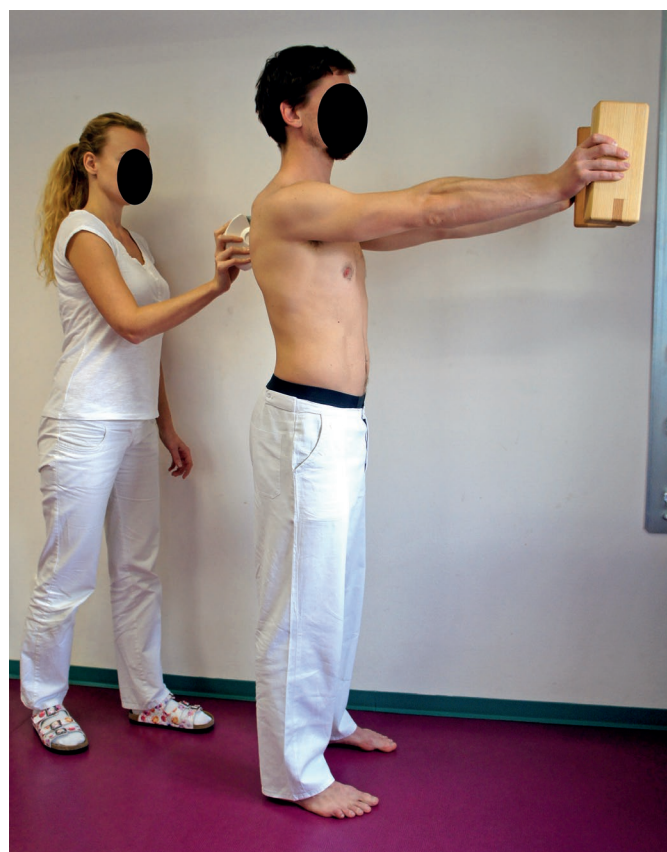
Fig. 4 Matthiass test.

test the participants held the weight of 1.5 kg in each hand with arms stretched forward. The spinal curve measurement was done in this position at the beginning and was repeated after 30 seconds of staying in this position. The change of the whole spinal inclination (inclination of the