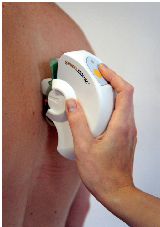
Fig. 1 The Spinal Mouse® device.

The device is provided with a measuring head with two wheels that automatically adjust themselves to the contour of the spine. During the measuring, the examiner stands behind the examined person and fluently guides the wheels in contact with the skin along the spine over the spinous processes from C7 processus spinosus to the beginning of the gluteal groove, where is the presumed position of S3 (Fig. 1). The turning of the wheels and the changes of inclination of the device towards the vertical line are simultaneously recorded during the examination. This data is wirelessly transferred to the computer, where