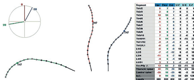
Fig. 2 Example of results of examination. The reconstructed spinal curves in standing upright position, maximal flexion and maximal extension along with the data chart with intervertebral and segmental angles in different body positions.

the spinal curve is reconstructed. The device can be used for spinal curve mapping and for an evaluation of the range of motion (ROM) in sagittal and frontal planes (14). The acquired information includes the shape of the spine, the length of measured segments, intersegmental angles, the angles of thoracic kyphosis and lumbar lordosis, the range of motion of the whole spine and in individual segments (Th1/2-L5/S1) and the inclination of the sacrum (12-14). The results are presented in pictures and tables, an example is shown in Figure 2.