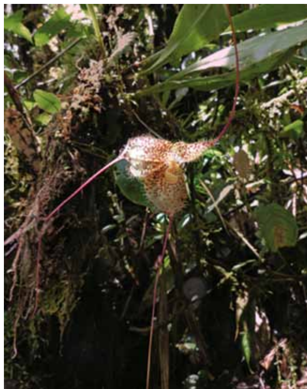
Fig. 6 Endemic orchid Dracula chimarca .

ditional settlements, including indigenous reserves, afro-colombian communities and rural reserves.