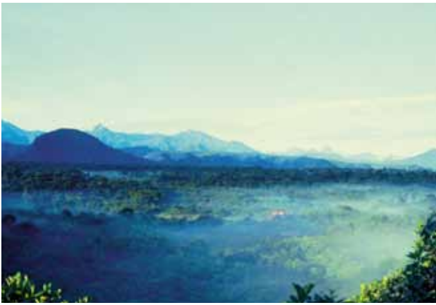
Fig. 2 Panoramic of La Planada nature reserve, Nariño department.