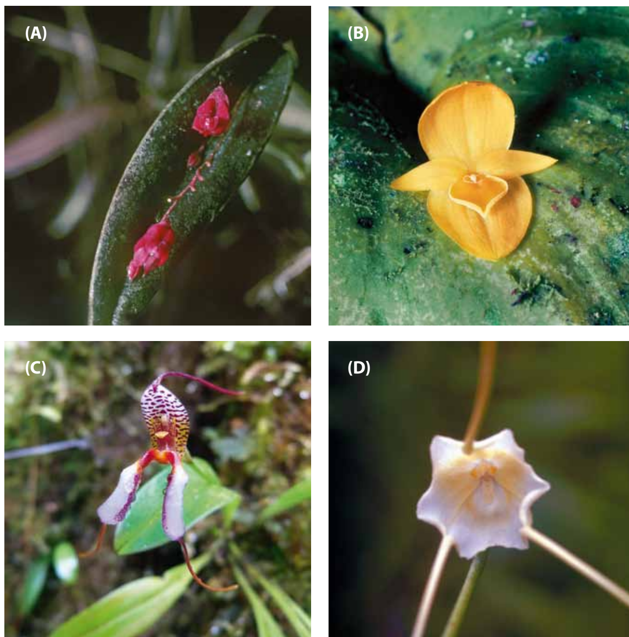
Fig. 11 Some species recently described or waiting description from the Western Andes of Colombia: (A) Lepanthes planadensis , (B) Pleurothallis titan , (C) Masdevallia hortensis , (D) Dracula levii .