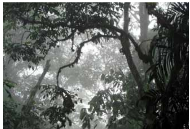
Fig. 4 Cloud forest in the Farallones de Cali National Park. Cali.

The extraction of wild orchids with economic value and for exhibition, although illegal today, still continues to reduce many species to local extinction. These activities have significantly diminished natural populations of species from the genera Cattleya , Coryanthes , Anguloa , Dracula , Stanhopea , Oncidium , and Masdevallia . In some cases, species have been exploited almost to local extinction. Contrary to the belief that CITES (the Convention on International Trade in Endangered Species of Wild Fauna