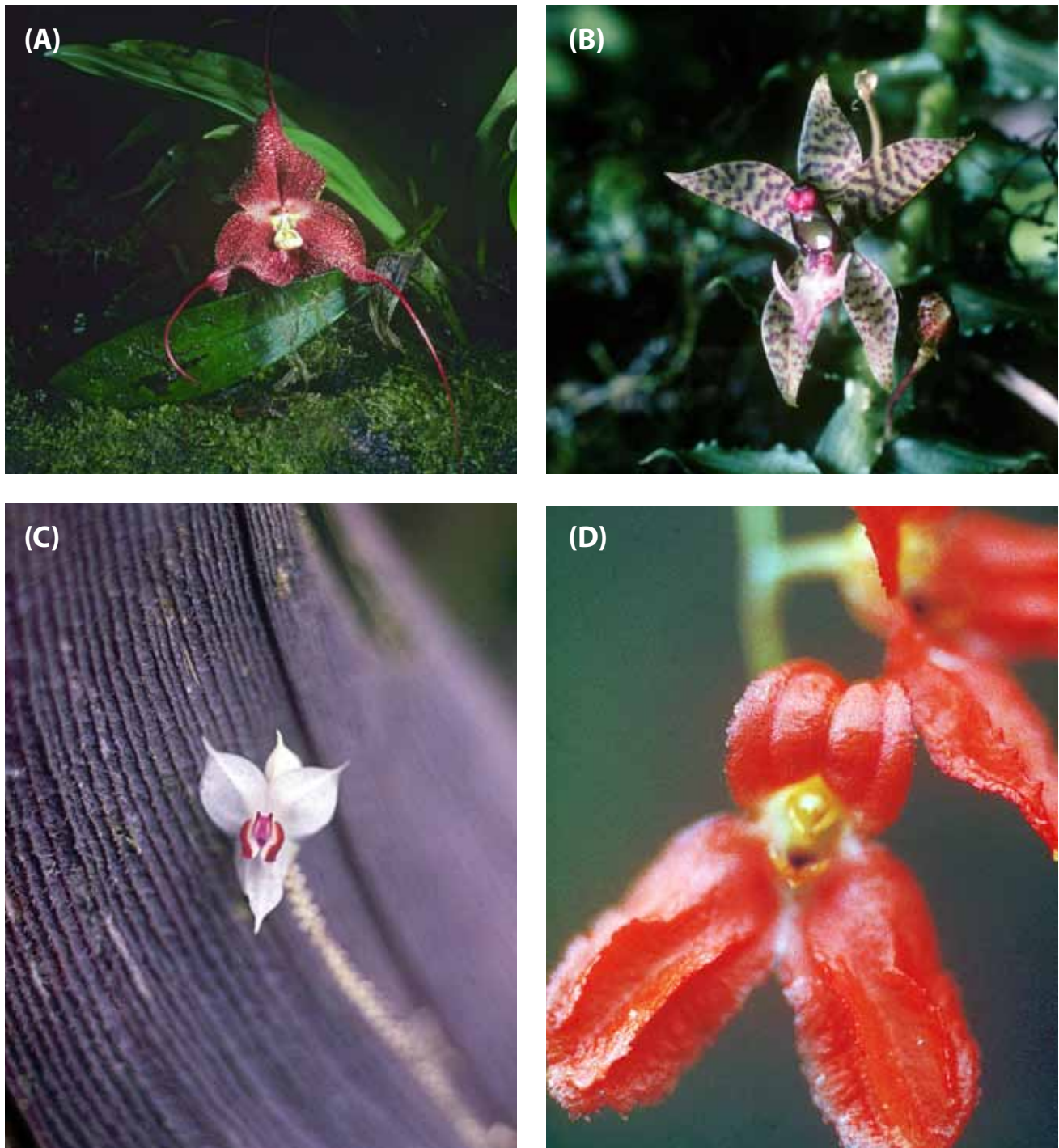
Fig. 7 Examples of endemic and endangered orchids of the cloud forests of the Western Andes: (A) Dracula wallisii , (B) Dichaea hystricina , (C) Lepanthes magnifica , (D) Porroglossum eduardii .

(2004) has published a magnificent catalog of the orchids from Maquipucuna Nature Reserve in Pichincha, Ecuador.