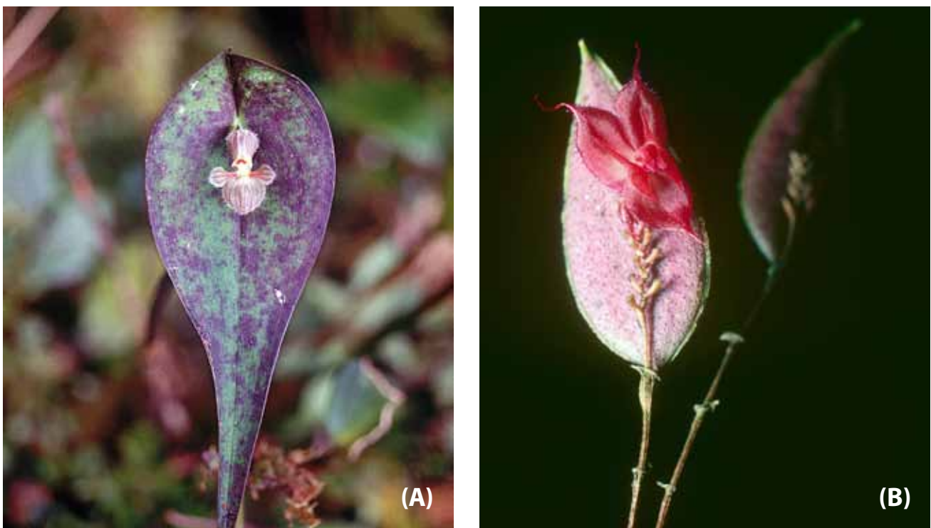
Fig. 10 Some species recently described or waiting description from the Western Andes of Colombia: (A) Pleurothallis perryii , (B) Lepanthes lycocephala .

support for conservation projects. Two key organizations are Conservation International and the World Conservation Union (IUCN), which has a group of orchid specialists and an orchid conservation education panel. There are several other institutions such as the American Orchid