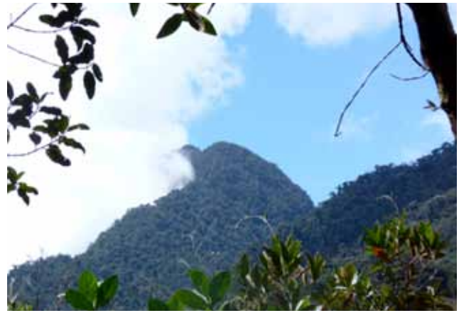
Fig. 3 La Mesenia reserve, Antioquia department.