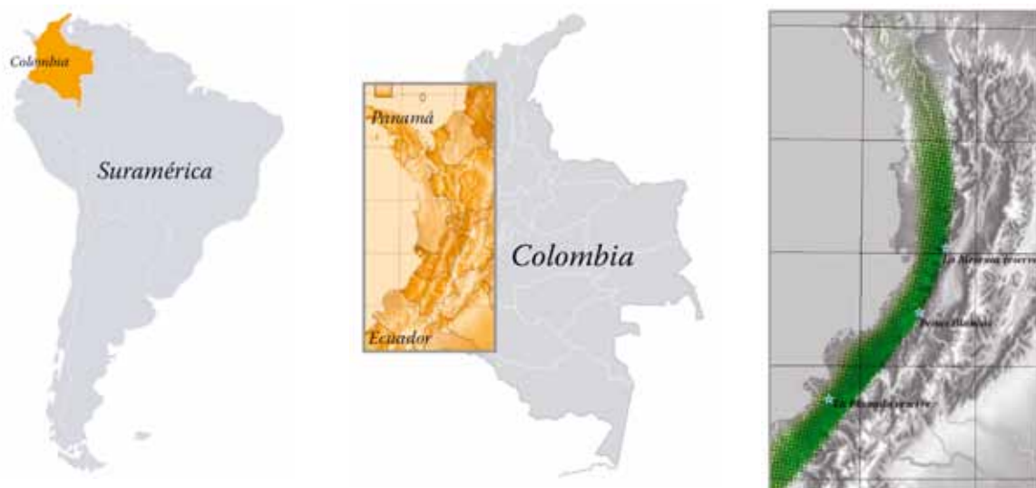
Fig. 1 Map of Colombia with the study areas.

In Colombia, orchids are notorious for being the plant family with the highest number of endangered species (Calderón-Sáenz 2007). The nation's cloud forest species share twice the risk, due to high levels of endemism and the speed at which many ecosystems are being changed to other usage such as for agriculture and livestock (Dixon and Phillips 2007). It is anticipated that an already difficult situation will worsen as a result of global warming (Jarvis 2009).