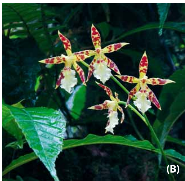
Fig. 8 Examples of endemic and endangered orchids of the cloud forests of the Western Andes: (A) Echinorhyncha vollesii , (B) Oncidium aspidorhinum .