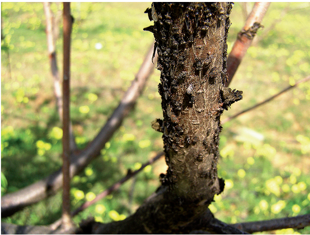
Fig. 1 Pterochloroides persicae population on peach showing symptoms of infection with entomopathogenic fungi.