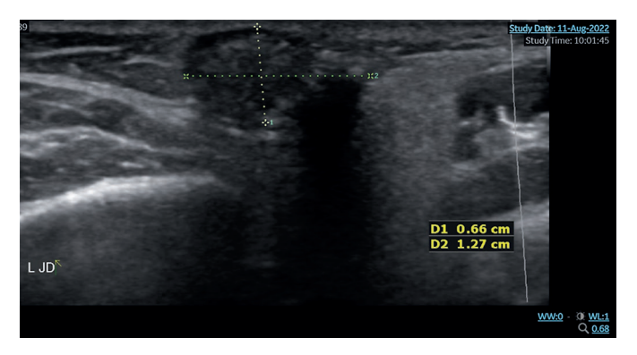
Fig. 1 Ultrasonography of a well-defined heterogeneous solid lesion measuring 0.7 \times 1.3 cm.

On examination, a 1 \times 1 cm firm, non-tender, mobile, painless swelling was found in the left infrauricular region. There were no overlying skin changes or palpable neck nodes. Other examinations were normal. He was treated as an infected sebaceous cyst and was given a course of oral antibiotics. However, he defaulted the follow-up due