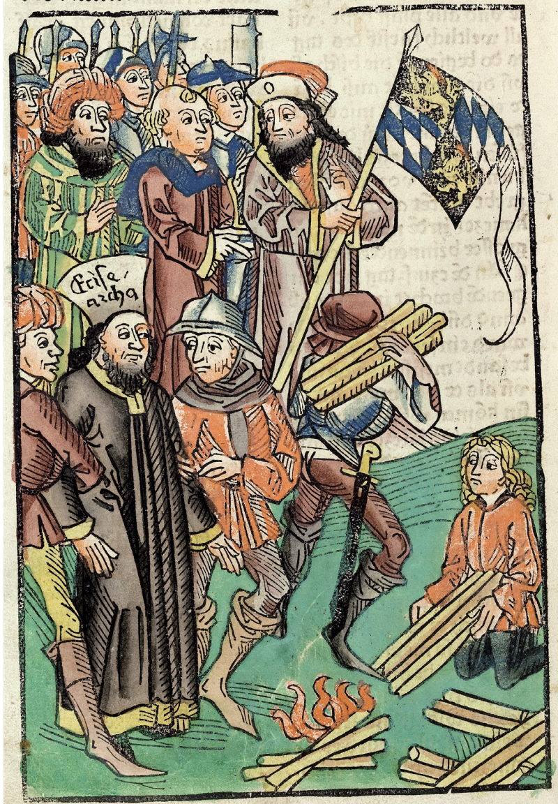
Fig. 4 (pp. 288-289): Heretic trials against Jan Hus and Jerome of Prague at the Council of Constance; from Ulrich von Richental, Concilium zu Constencz , Augsburg 1483, fol. 34r and 38v (University Library Heidelberg, Q 2060 qt. INC, http://digi.ub.uni-heidelberg.de/diglit/ir00196000 ).

Die ward meyster Jeronimus des hussien gesell aufgefürt vnd verbrannt da der huss verbrannt ward.