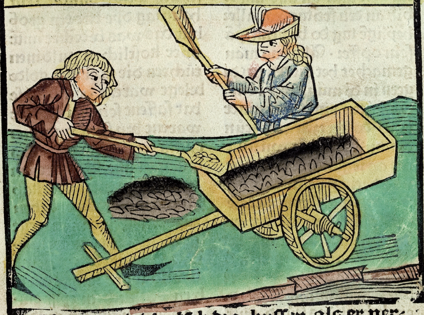
Wie ward die äsch des huffen als er verbrant ward vnd sein gebein in den rein gefürt.