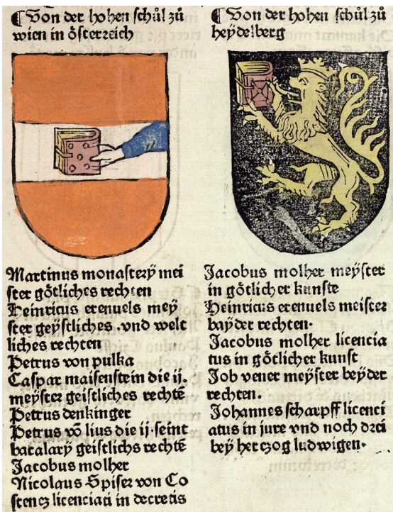
Fig. 2: The coats of arms of the universities of Vienna, Heidelberg and Prague from Ulrich von Richental, Concilium zu Constencz, Augsburg 1483, fol. 146r–146v (University Library of Heidelberg, Q 2060 qt. INC, http://digi.ub.uni-heidelberg.de/diglit/ir00196000 ).