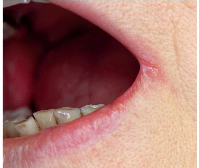
Fig. 1 Angular cheilitis.

Extraoral clinical examination revealed bilateral angular cheilitis with central rhagades with only skin and transition zone involved (Figure 1). Other skin findings on the skull and face were normal. Lymph nodes were not enlarged. Intraoral examination showed atrophic glossitis