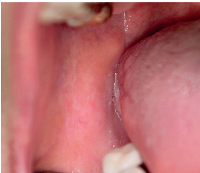
Fig. 6 Healthy buccal mucosa after treatment