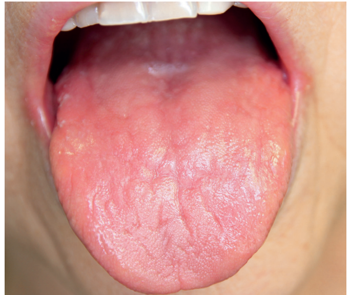
Fig. 2 Atrophic tongue mucosa.