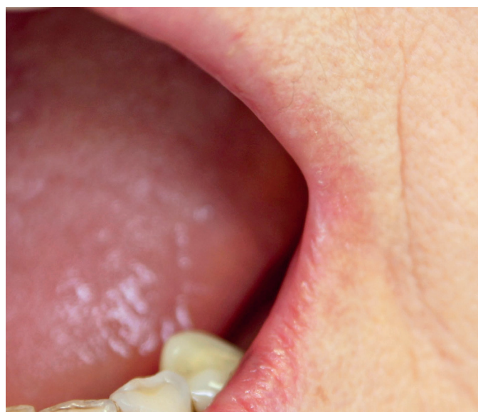
Fig. 4 Angular cheilitis after treatment.

Burning mouth syndrome is one of the most frequent signs that bring patients to dental medicine clinics. It represents a wide variety of diseases ranging from benign to severe disorders. The exact etiology of burning mouth cannot be frequently identified, but the cause may be identified in many patients (7). Nutrition deficiencies and anemia represent the frequent and often reversible cause of burning mouth. Lin et al. described a decrease