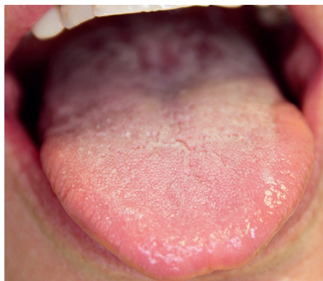
Fig. 5 Healthy tongue after treatment.